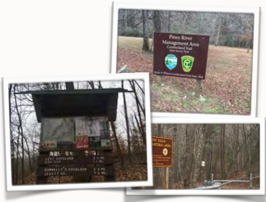
Mountain lakes, streams, and trails await!